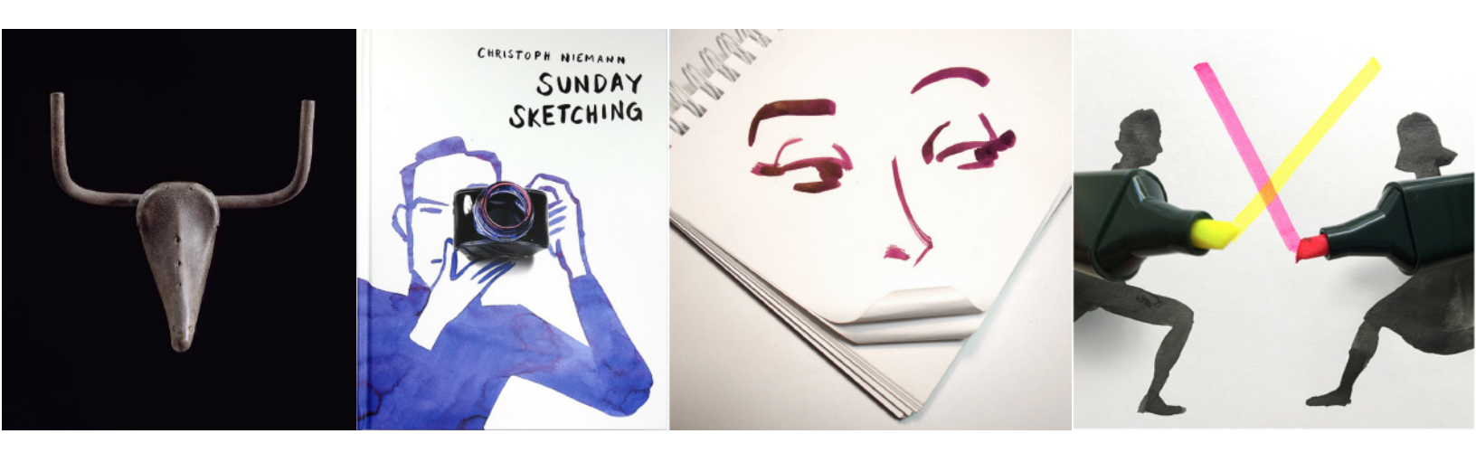
Figure 1 Bull's Head by Picasso. Figure 2.3 and 4 sketches by Christoph Neimann from Sunday Sketching series

The concept of Complete me was inspired among others by art such as Bull's Head by Picasso as well as Sunday Sketching, the work of the illustrator Christoph Neimann.