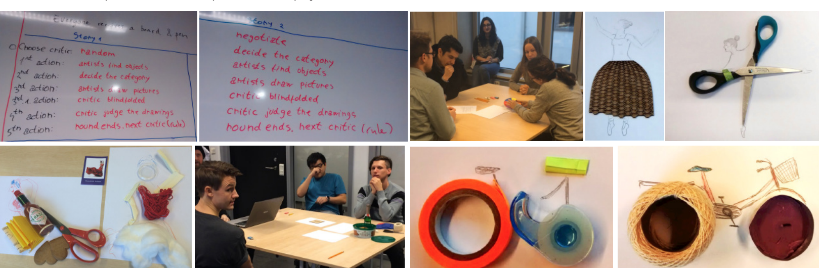
Figures 6-14 Player stories, play-testings and outcomes